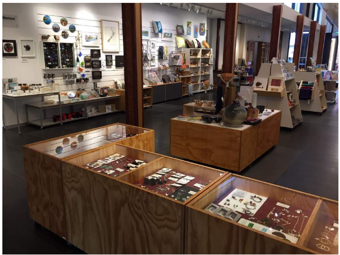
The Suter Shop for unique locally produced gifts