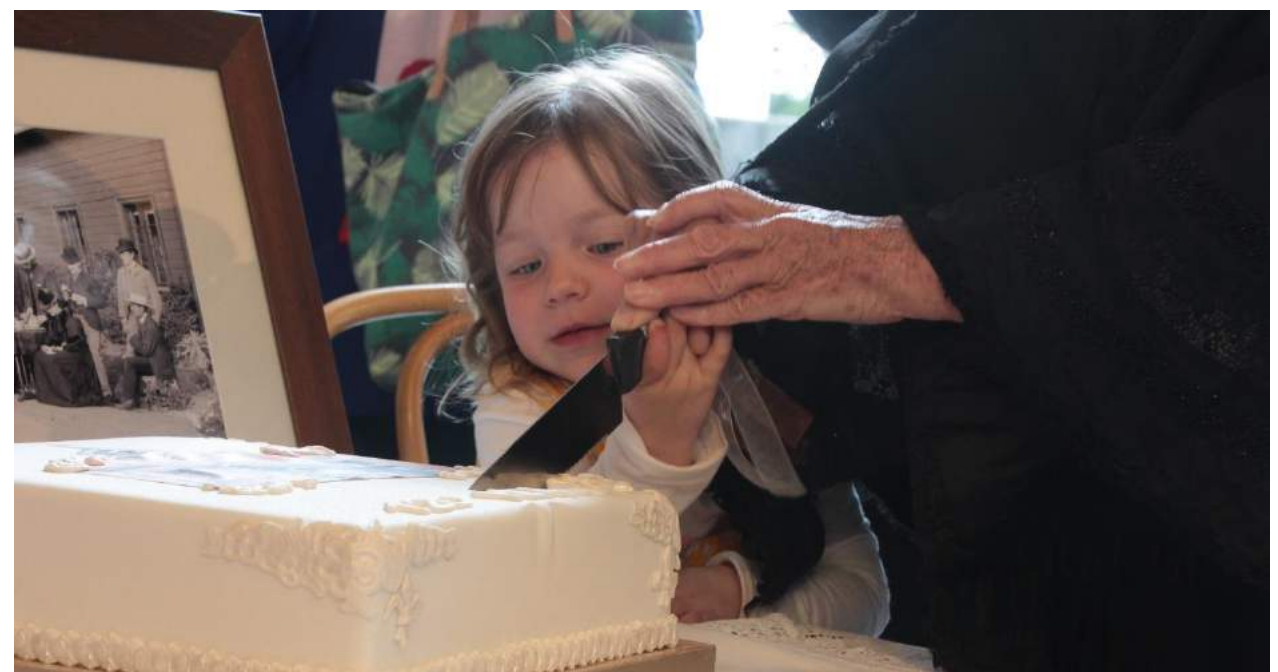
Cutting the cake to celebrate The Suter's re-opening 3<sup>rd</sup> anniversary since the redevelopment; and 120<sup>th</sup> year since first opening to the public in 1899.

The Suter<sup>2</sup> jointly hosted talks, weaving and poi making workshops to mark Te Wiki o te Reo Māori and was looking forward to contributing to the city's 2020 Heritage Festival when COVID restrictions struck.