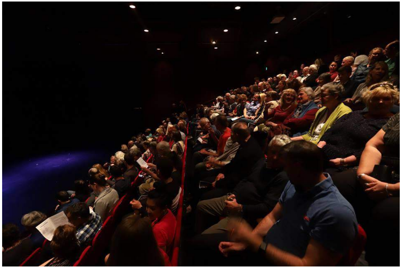
Audience enjoyment at The Suter Theatre