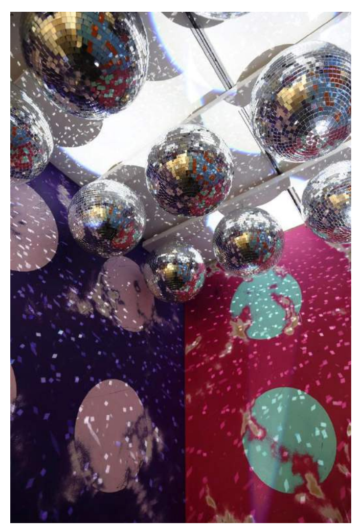
Shannon Novak (detail) A Measure of Health, installation from Sympathetic Resonance exhibition

3.1.2 Ensure that The Suter<sup>®</sup> is well managed and operates within its agreed plans: Reports , plans and budgets meet set deadlines . The Risk Management Plan is reviewed annually, and mitigation strategies identified are implemented (including cyber security, and response planning for natural hazards and climate change).