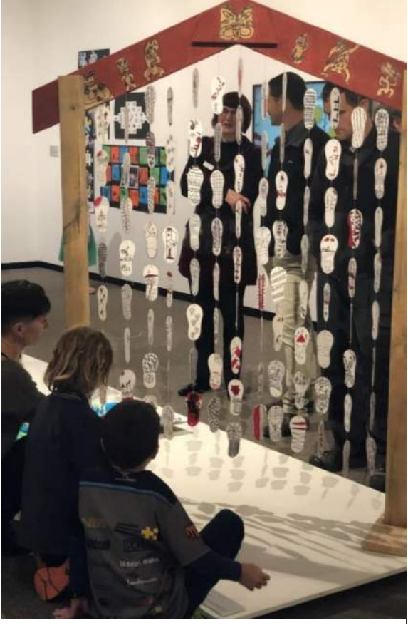
Students' footprint exhibit in Aratoi Our Journeys

Achieved: Exhibitions are planned 12-28 months ahead, however COVID-19 forced a major revision of the exhibition programme, both as delivered March-June 2020 and for the future programme.