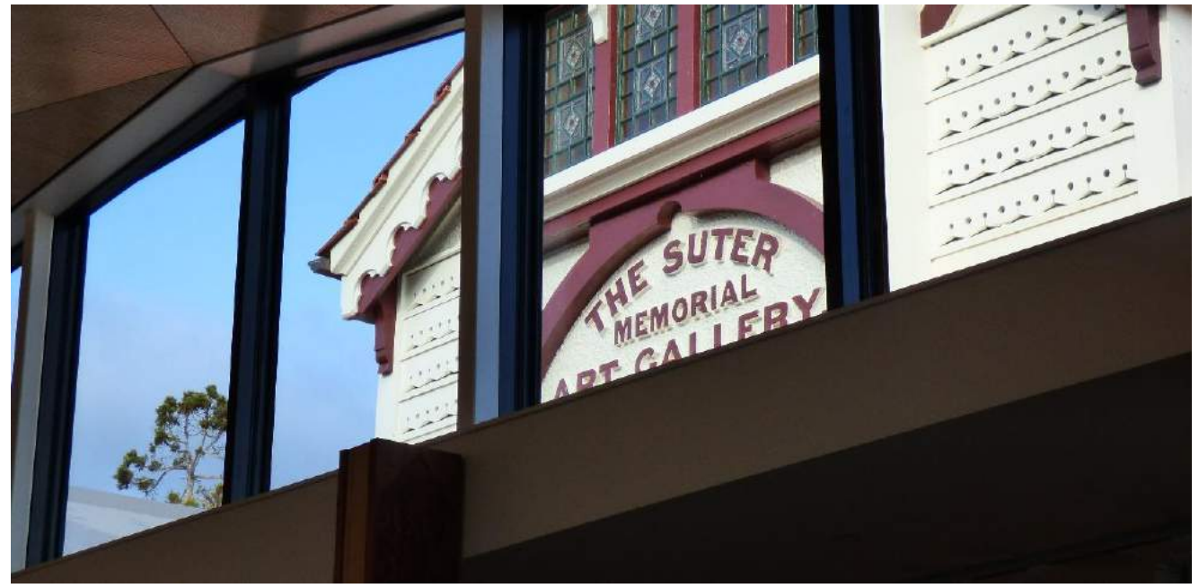
The Suter back through the future