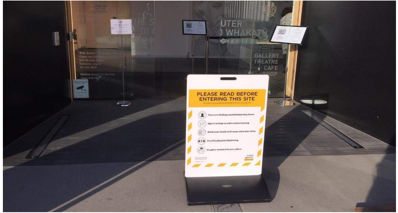
The Suter in Covid-19 preparedness during Level 2.