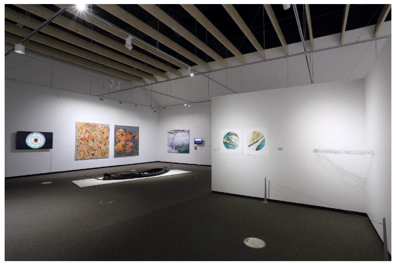
The Water Project exhibition: developed by Ashburton Art Gallery